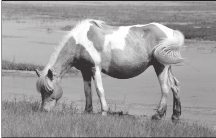
Text and photographs from "The Wild Horses of Assateague Island," National Park Service, US Department of the Interior