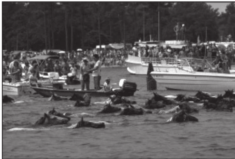
Photograph of onlookers watching ponies swimming during roundup (Image # 80995627)