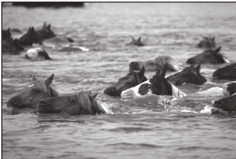
Photograph of wild Chincoteague ponies swimming the Assateague Channel (# ngs12_0248), copyright © by Medford Taylor/National Geographic/Getty Images. Used by permission.