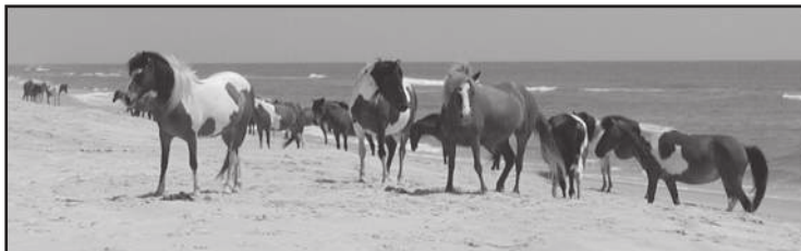
Text and photographs from “The Wild Horses of Assateague Island,” National Park Service, US Department of the Interior