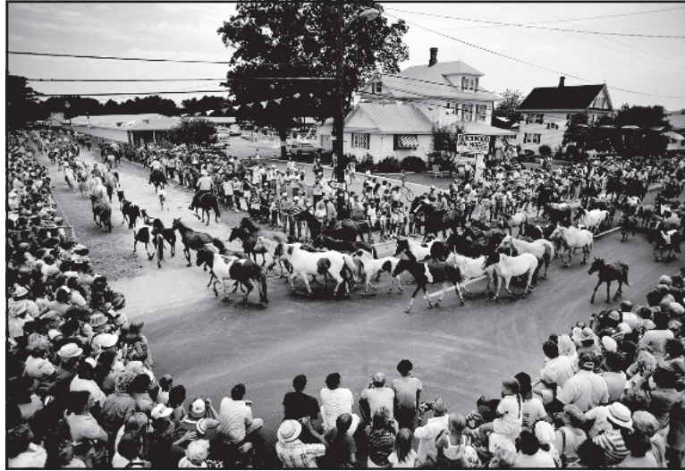
Photograph of ponies walking through town (NGS Image No. 719970), copyright © by Medford Taylor/National Geographic Stock. Used by permission.