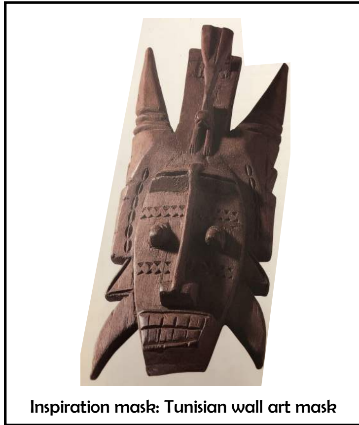
Inspiration mask: Tunisian wall art mask