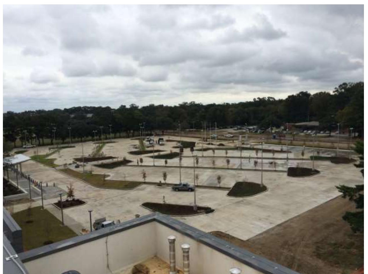
Looking from the southern roof garden to the new Goodwood parking area.