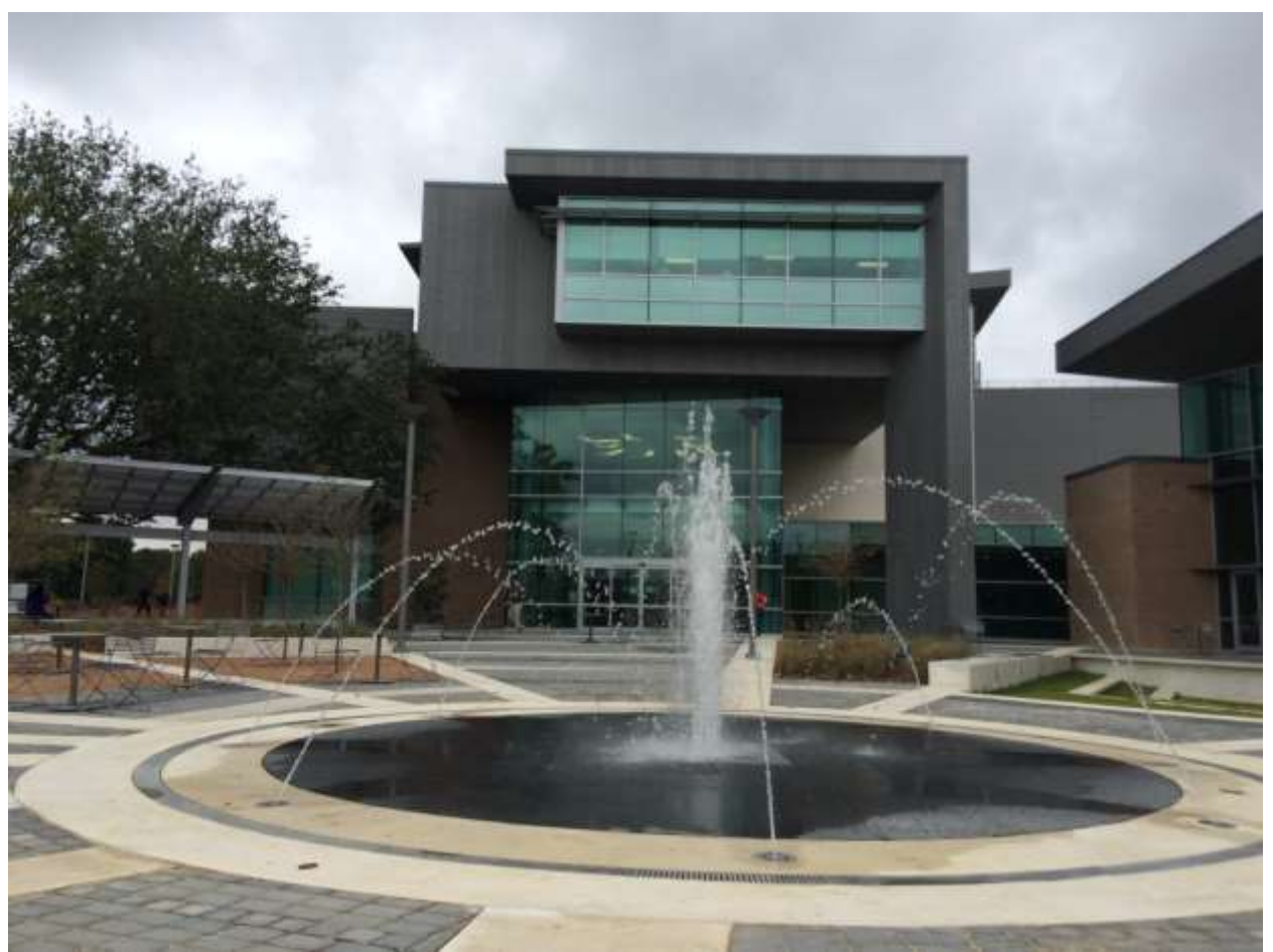
Looking across the Splash pad at the Library Entry.