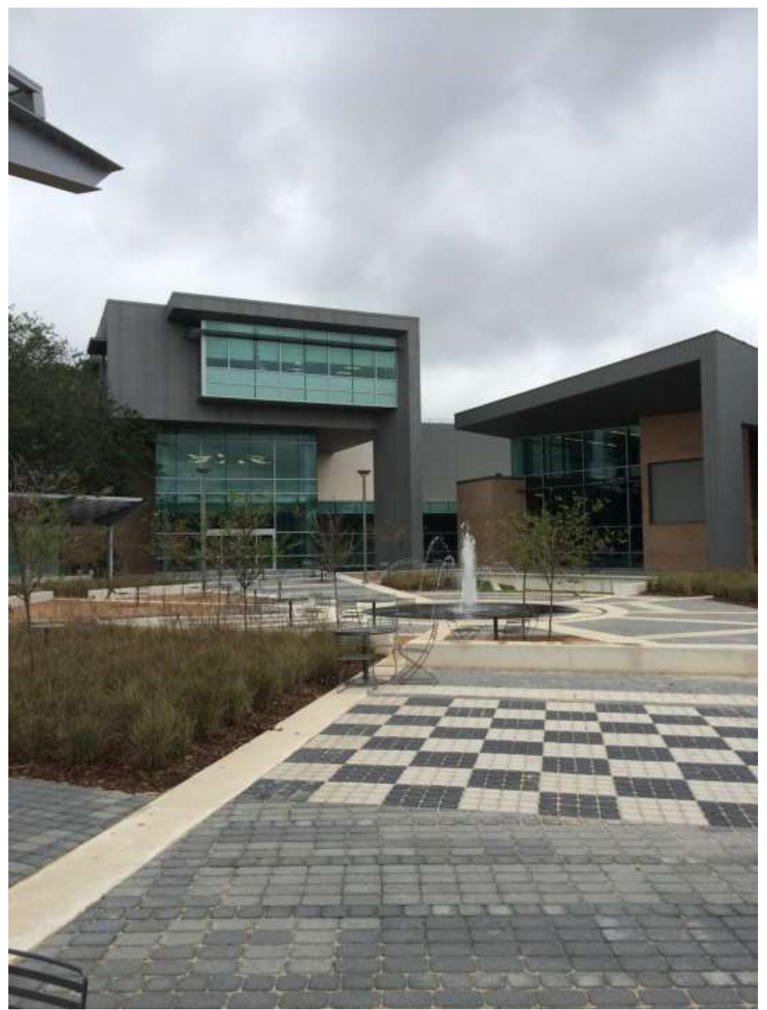
Looking across the Plaza at the Library.