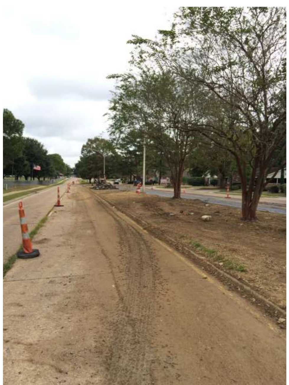
Looking east at the Goodwood Boulevard Median work.