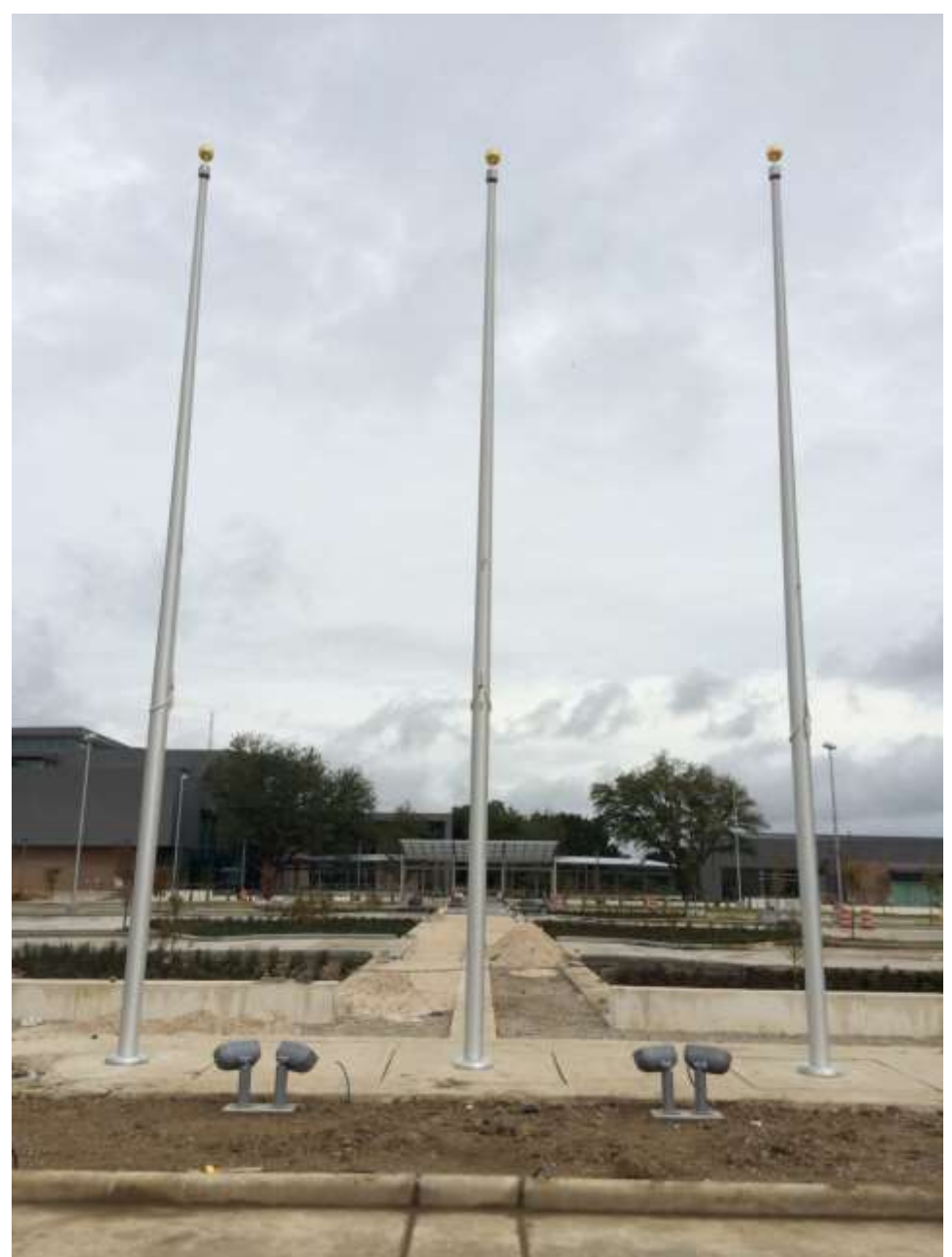
Looking from the parking lot to the Drop Off Canopy and the Plaza.