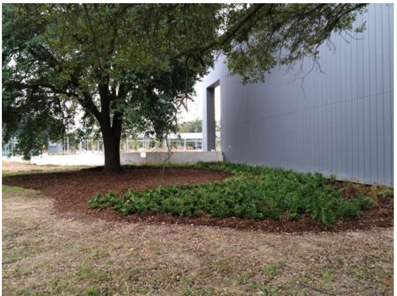
Looking toward the Plaza at the fern garden at the Memorial Oaks.