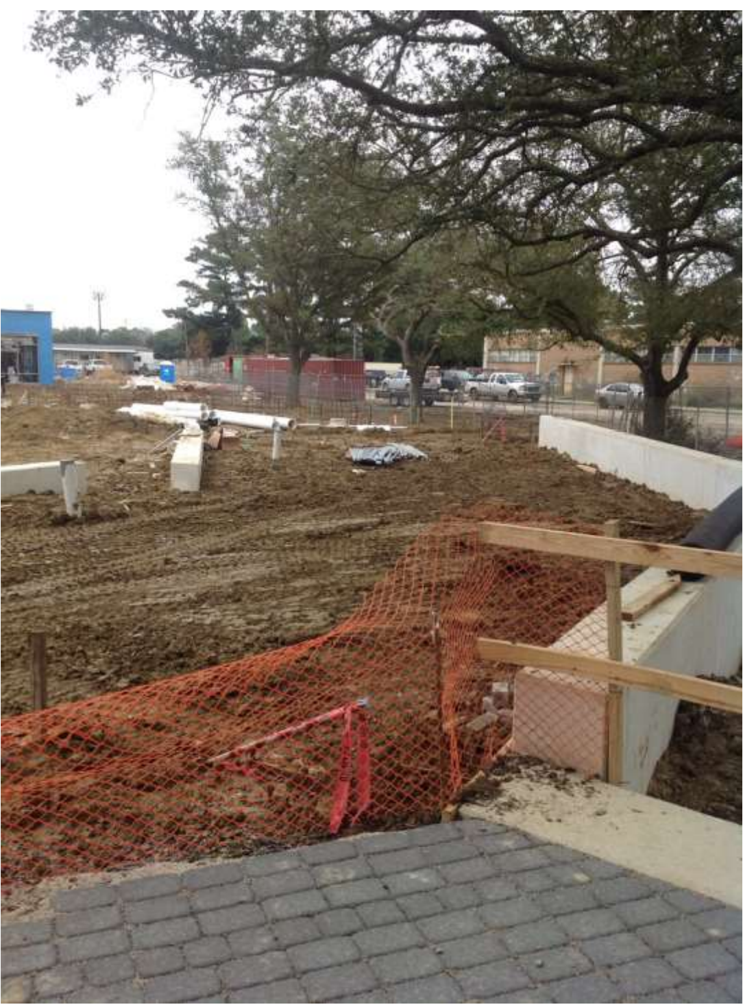
Looking into the Plaza from the Library Entry.