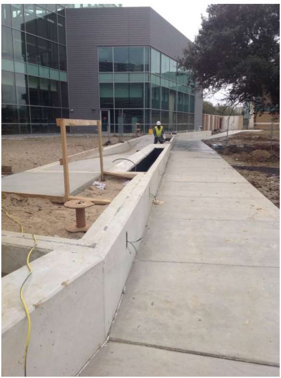
Looking toward the North Courtyard