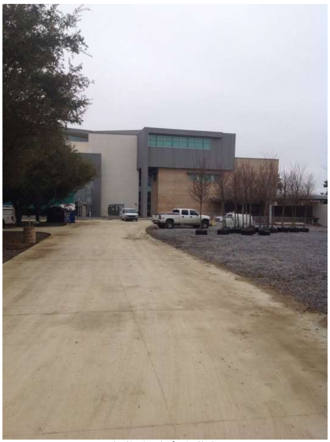
Looking into the Service Yard.