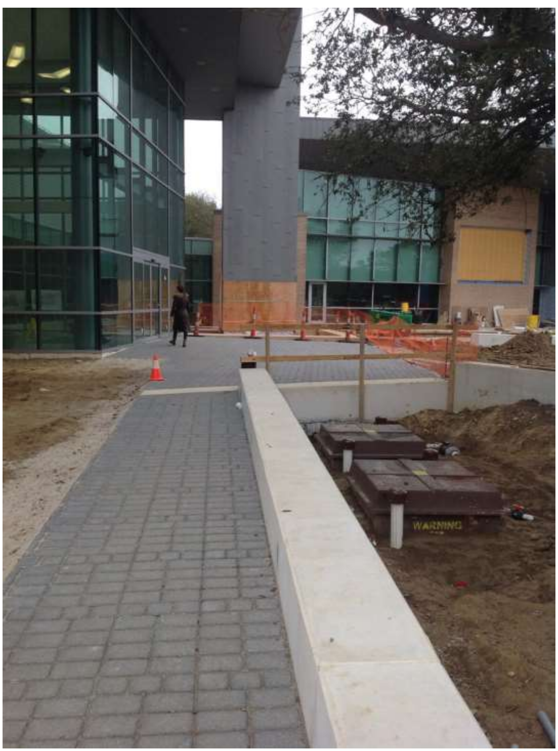
Looking toward the Library entry.