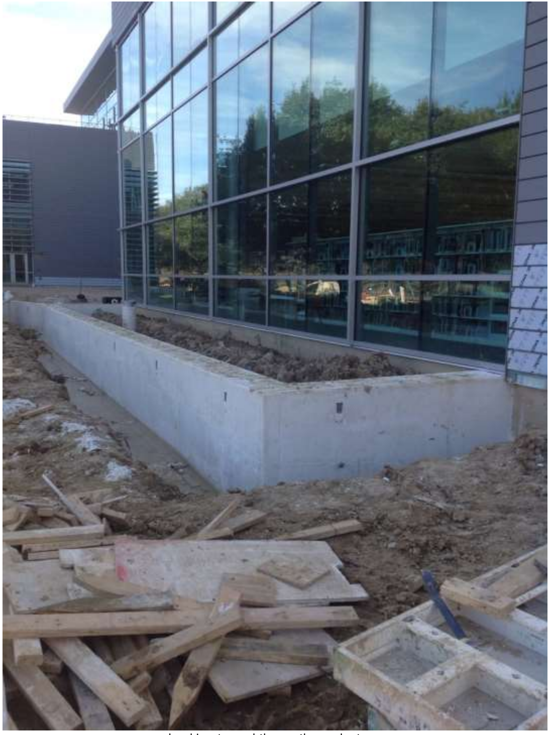
Looking toward the northern planters.