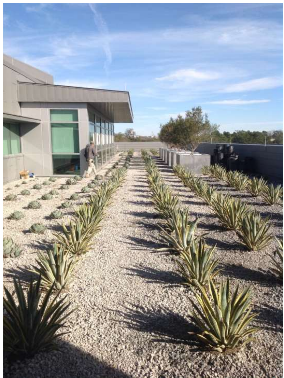
Looking toward the east on the South Planted Roof.