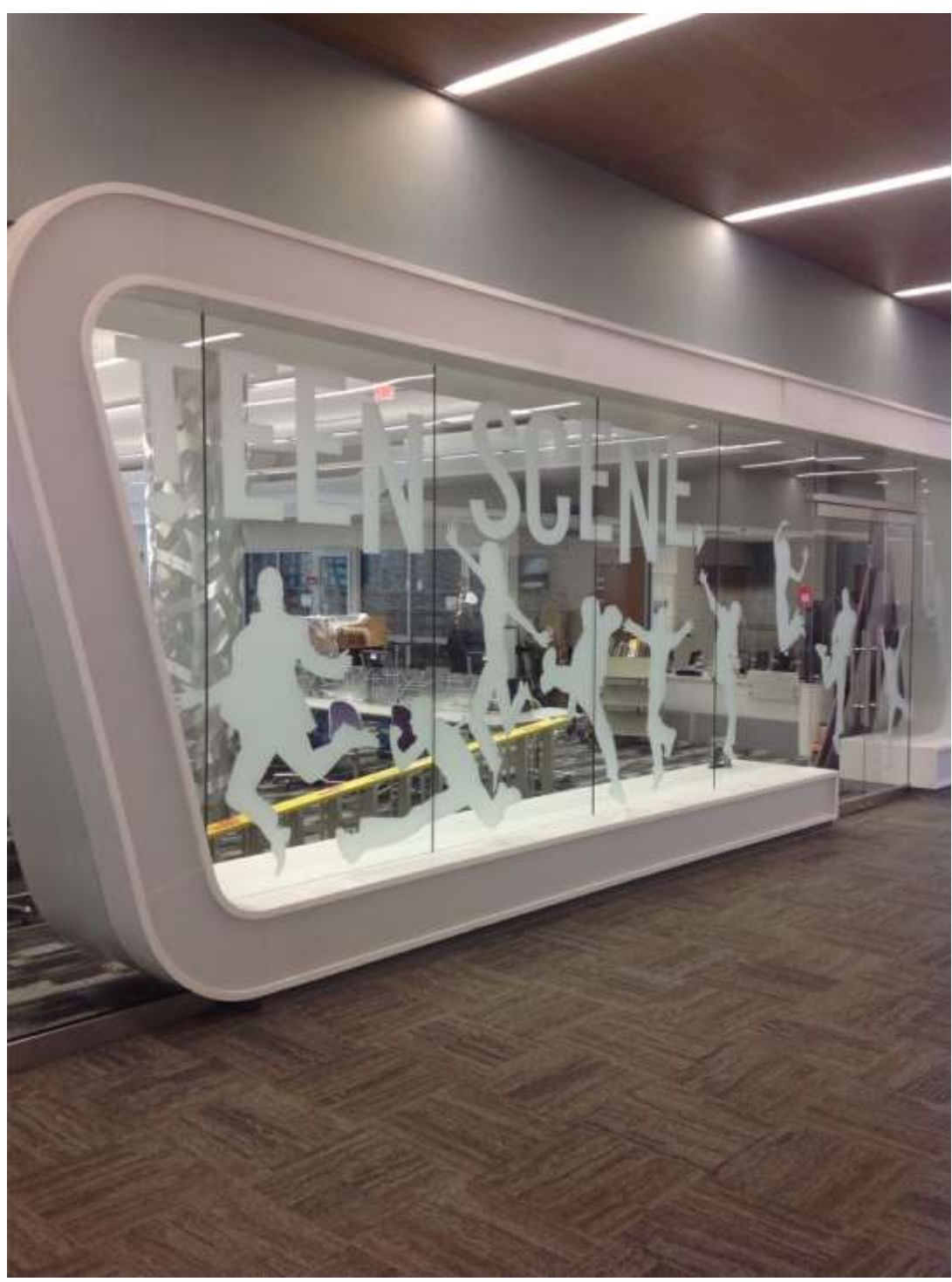
Looking toward the Teen Entry.