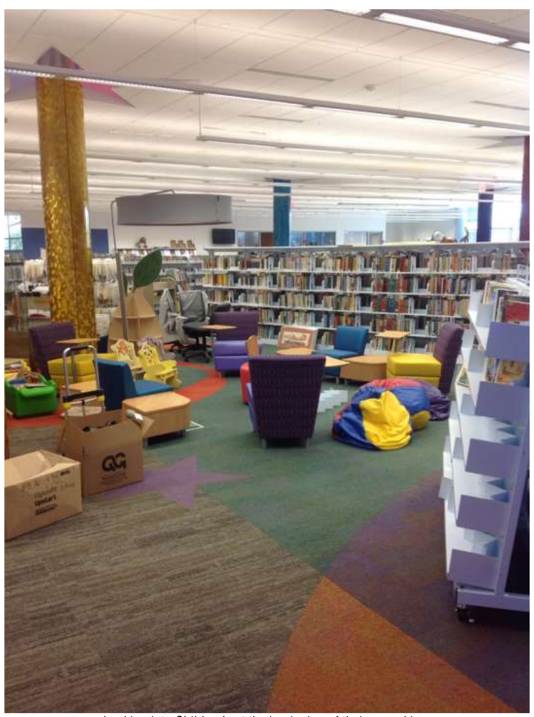
Looking into Children's at the beginning of their unpacking.