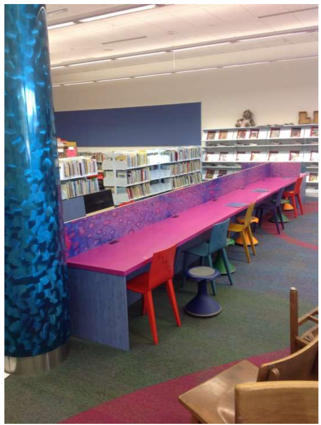
Looking toward the Children's computer stations.