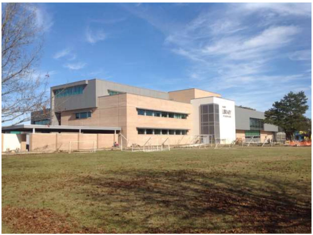
Looking northeast toward the library.