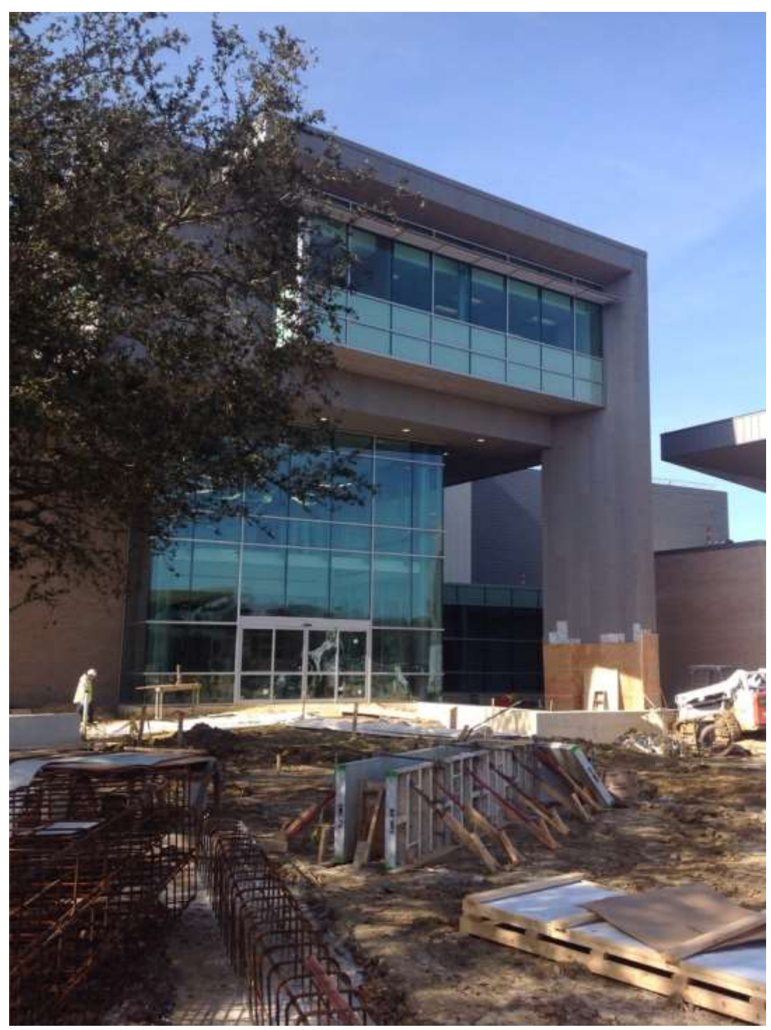
Looking toward the Library Main Entry from the Plaza.