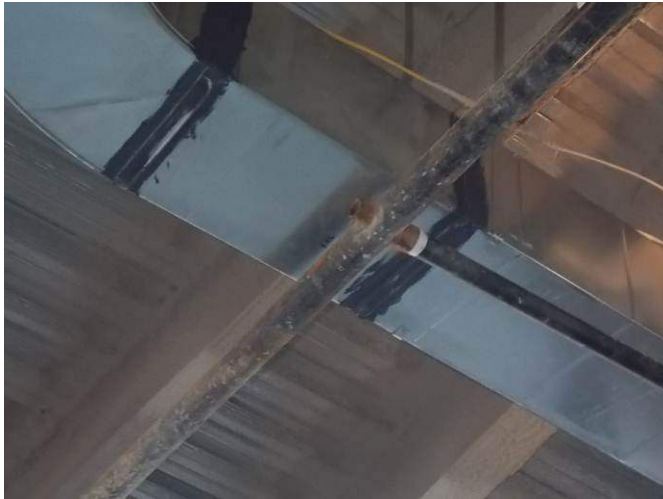
Protect open pipe.