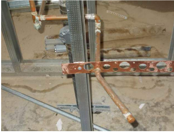
Bent copper pipe