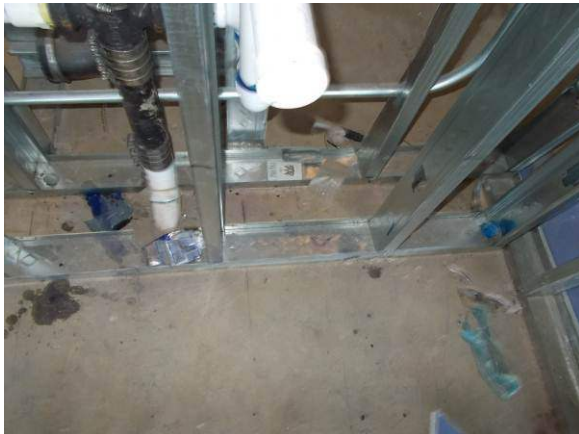
Clean cans, cigarette pack, debris from wall framing prior to installing sheet rock.