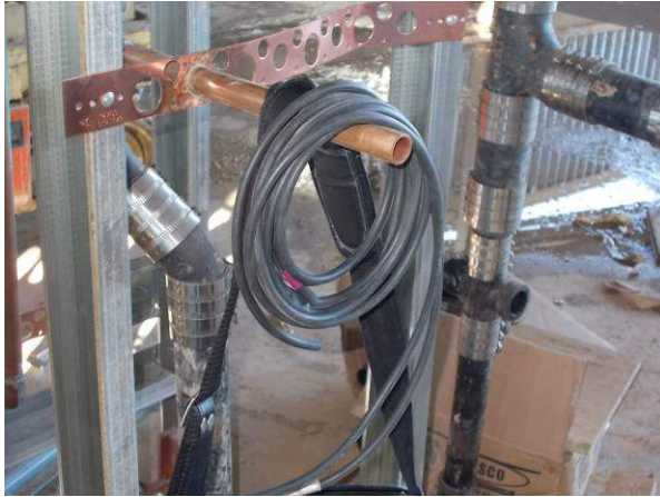
Water line pipe end not capped