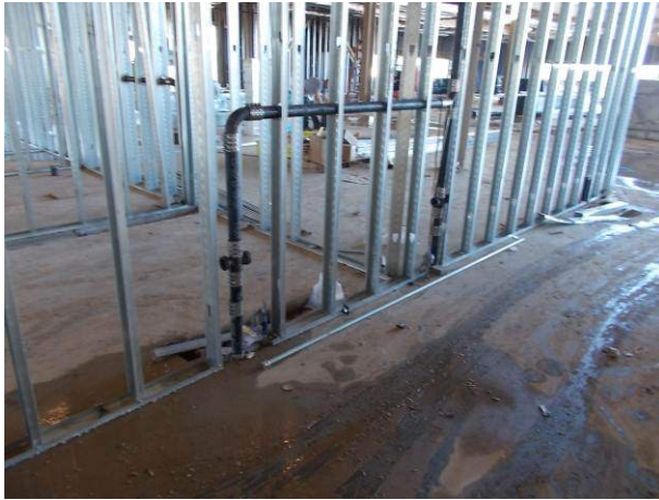
Protect open pipe