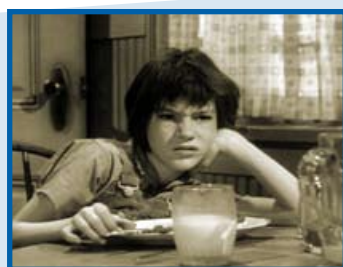
Visit with Academy Award nominee Mary Badham on April 14, at 2:00 p.m.

What better way to come together than by taking part in The Big Read: One Book/One Community program, sponsored by The Big Read, the East Baton Rouge Parish Library, and the Baton Rouge Area Chamber (BRAC). So far, The Big Read: One Book/One Community program has brought together nine parishes with movie showings, presentations by authors, oral history, documentaries, book discussions, and even more planned through May.