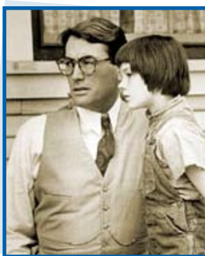
Gregory Peck as Atticus Finch and Mary Badham as “Scout”