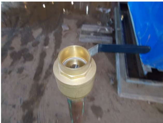
Protect open valve.