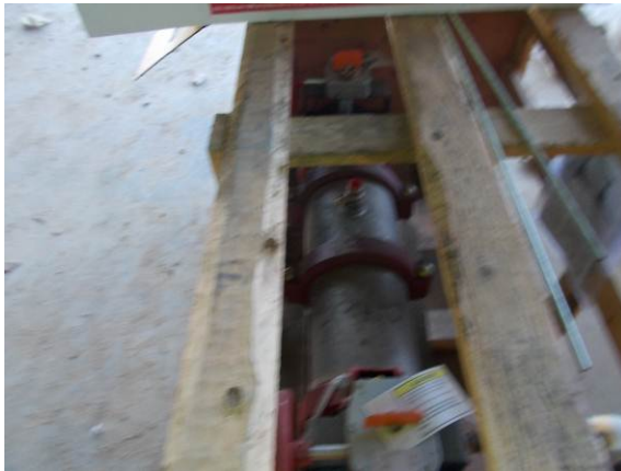
Construction dirt on valve assembly. Protect stored material.