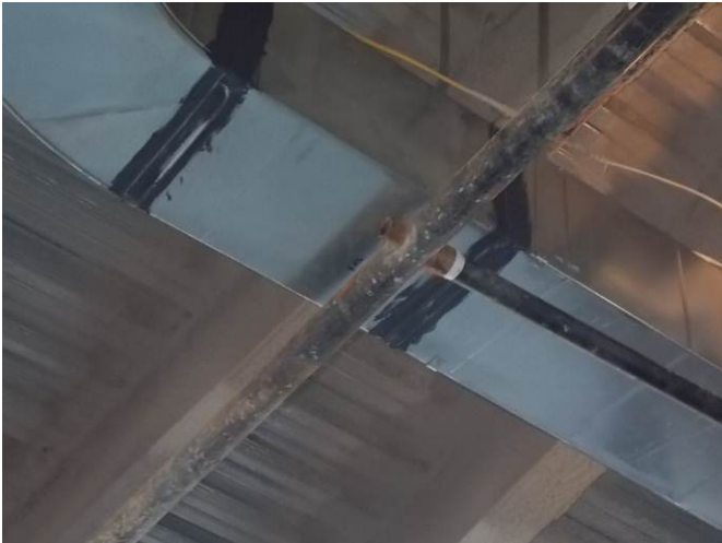
Protect open pipe.