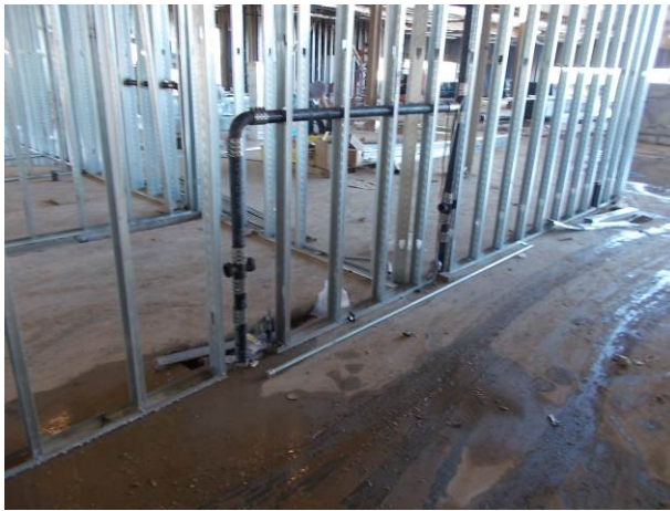
Protect open pipe