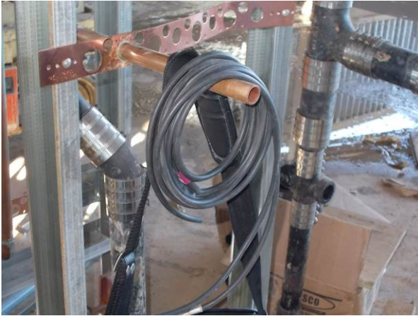
Water line pipe end not capped