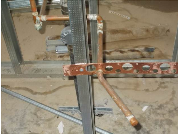
Bent copper pipe