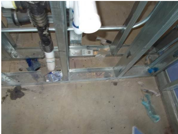
Clean cans, cigarette pack, debris from wall framing prior to installing sheet rock.