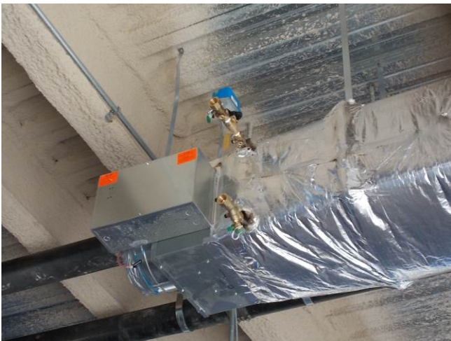
Protect open pipe and valves.